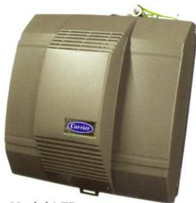
Model LFP Humidifier