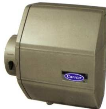
Model LBP Humidifier