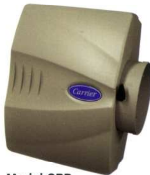
Model SBP Humidifier